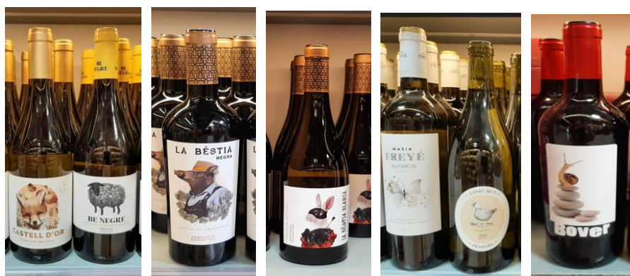
Fig. 3. Example of Spanish wines for sale in a store (August 2024, Catalogna), presented in the same corner of the store, numerous, thus bringing together a wide range of bottles adorned with animal labels

For South America, a study emphasized the importance of the symbolic values of wine in contributing towards a favorable attitude to wine in general (De Toni et al., 2022).