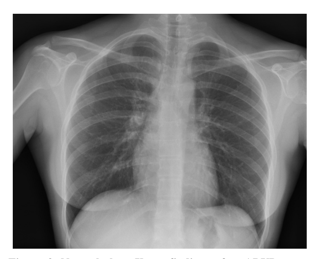
Figure 3. Normal chest X-ray findings after ABVD treatment.

long duration of chest pain (10 days), cardiac ischemia and life-threatening diseases ( i.e. pulmonary embolism, tension pneumothorax) were unlikely. The absence of any relation with physical activity was not consistent with the hypothesis of pericarditis, cardiac ischemia or pleuritis. Moreover, the absence of fever, cough and sputum was not meeting clinical criteria of pneumonia. Considering the normality of thoracic clinical examination, a chest wall cause ( i.e. costochondritis, herpes zoster, rib fracture, sterno-clavicular arthritis) was unlikely. A hypothesis of gastro-oesophageal reflux disease or of cholelithiasis was not likely since the pain was continuous, not related to meals and it was not described as epigastric pain. Moreover, patient was calm, non-anxious and this was in contrast with a diagnosis of psychiatric