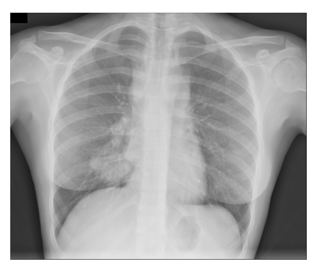
Figure 1. Chest X-ray findings: multiple lymphoadenopathies of the superior mediastinum and a poly-lobated mass in the middle lobe of the right lung (5.5 cm).

Considering young age, good general conditions (patient was appearing comfortable at medical visit), and